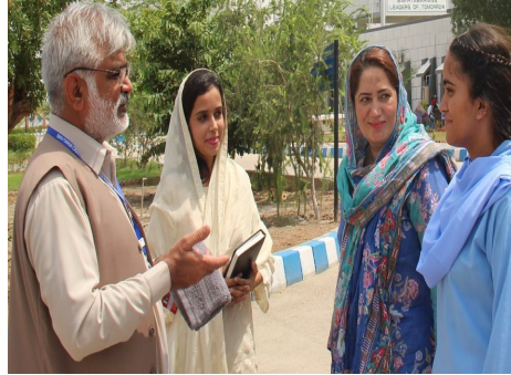
Some of the glimpses from Parents Meet Day

parents, are treated like Bakhtawarians family. We don't shout hollow, we act. Parents of all five batches visited the BCCG to meet and greet their wards on 12 th September 2021. Parents started arriving at 09:00 am in the parent's area of the college.