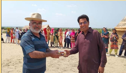
Bakhtawarians being busy in learning and enjoying in their Excursion Trip