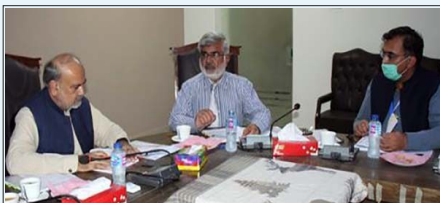
The Finance Committee of college is discussing miscellaneous financial matters of the college