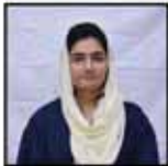
Lecturer in Pak. st M.A Pak.st., M.Phil